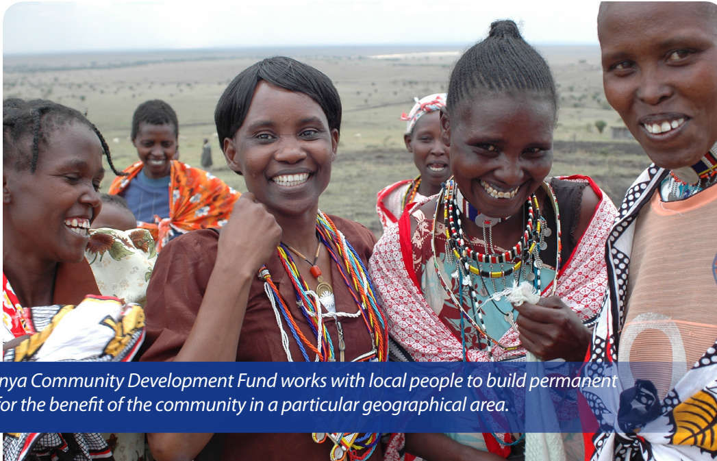
The Kenya Community Development Fund works with local people to build permanent funds for the benefit of the community in a particular geographical area.

A particularly important task is to build on various indicator sets developed by the Knight Foundation 10 and the Global Fund for Community Foundations. 11 Once this is done, it would be useful to publish studies that demonstrate the added value of community philanthropy to the field. These should focus on what is different about outcomes when community philanthropy is present compared with when it is not. As we saw with the Tewa example earlier on, it is empirical evidence that provides proof of concept.